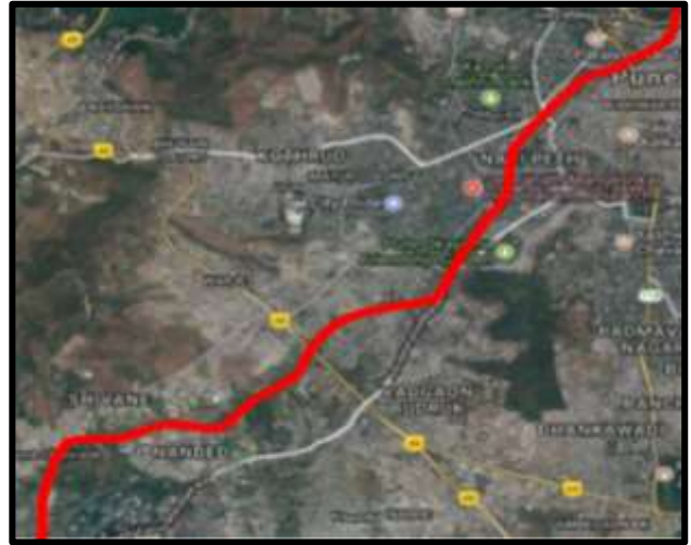
Figure 1 Stretch of Mutha River

The Mutha River in Pune Region; originates in the Western Ghats and flows eastward for about 21 km when it merges with the Mula River in the city of Pune. Mutha river has been dammed twice, first at the Panshet Dam (on the Ambi River), used as a source of drinking water for Pune city and irrigation. The water released here is dammed again at Khadakwasla and is an important source of drinking water for Pune. One more dam has been built later on the Mutha River at Temghar. After merging with the Mula River in Pune, it flows on as the Mula-Mutha River to join the Bhima River at Sangameshwar. All along its journey in Pune city it receives raw sewage and garbage and is one of the most polluted rivers. Pune takes about 1000 MLD water for drinking from Mutha River through closed pipes and discharges about 750 MLD of its sewage into Mula River.