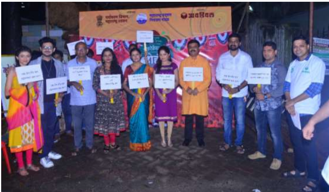
Anti-noise pollution awareness rally on the eve of Dahi-handi (Gopalkala) festival was organized with participation of famous Marathi film industry celebrities on the Open Deck Bus Service of Best Transport Service in the month of August 2017.