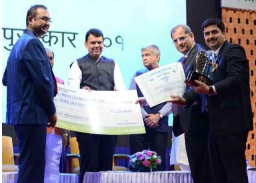
On the eve of World Environment Day on 5th June 2017, Hon'ble Shri Devendra Fadnavis, Chief Minister, GoM giving away Vasundhara Awards to the entrepreneurs who have introduced best environment-friendly practices in their industry, at Y. B. Chavan Auditorium, Mumbai.