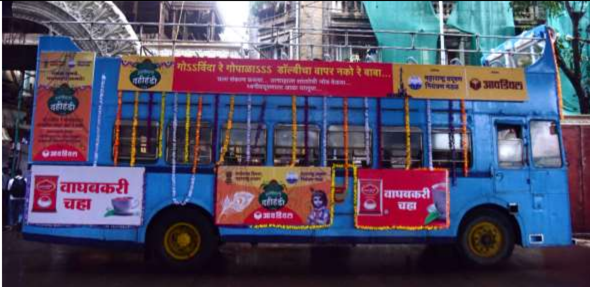
Anti-noise pollution awareness rally on the eve of Dahi-handi (Gopalkala) festival was organized with participation of famous Marathi film industry celebrities on the Open Deck Bus Service of Best Transport Service in the month of August 2017.