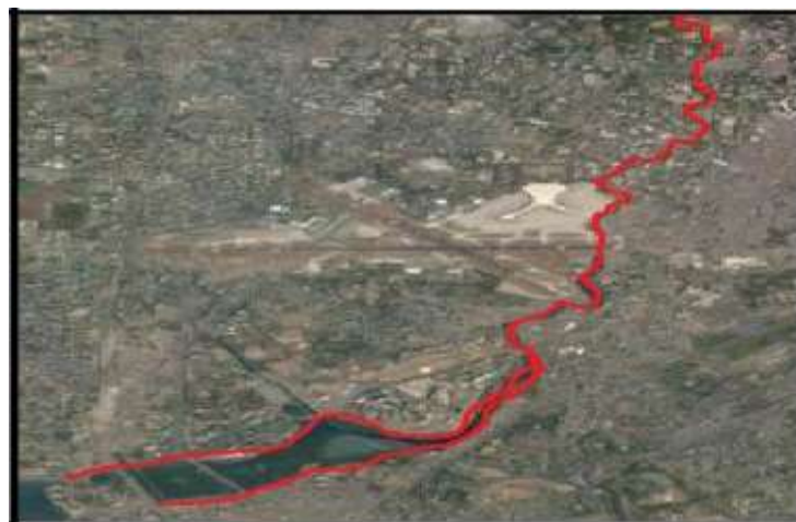
Figure 1 Polluted Stretch of Mithi River