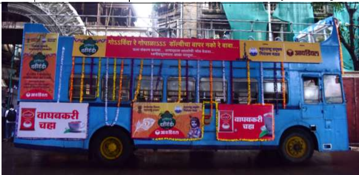
Anti-noise pollution awareness rally on the eve of Dahi-handi (Gopalkala) festival was organized with participation of famous Marathi film industry celebrities on the Open Deck Bus Service of Best Transport Service in the month of August 2017.