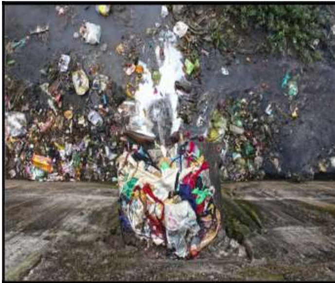
Figure 2 Waste discharge into Mithi River

MPCB has carried out monitoring of at 16 different locations along the river stretch. These sampling locations were approximately 2.5kms apart throughout the stretch of Mithi from origin to its convergence into Arabian Sea.