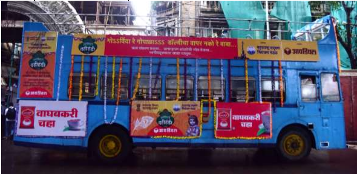
Anti-noise pollution awareness rally on the eve of Dahi-handi (Gopalkala) festival was organized with participation of famous Marathi film industry celebrities on the Open Deck Bus Service of Best Transport Service in the month of August 2017.

along with celebrities from the film and theatre industry. Public Relations Officer, MPCB was present during this event.