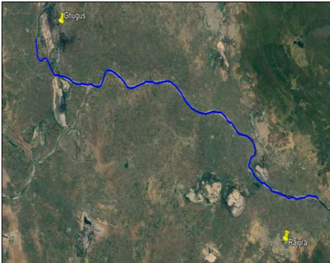
Figure 1 Stretch of Wardha River

Wardha River originates at an altitude of 777 Metres in the Satpura Range near Multai in Betul district of Madhya Pradesh from the origin it flows 32 Km in Madhya Pradesh and then enter into Maharashtra. After traversing 528 Km, it joins Wainganga at Seoni in Chandrapur District forming the Pranahita which ultimately into the Godavari River.