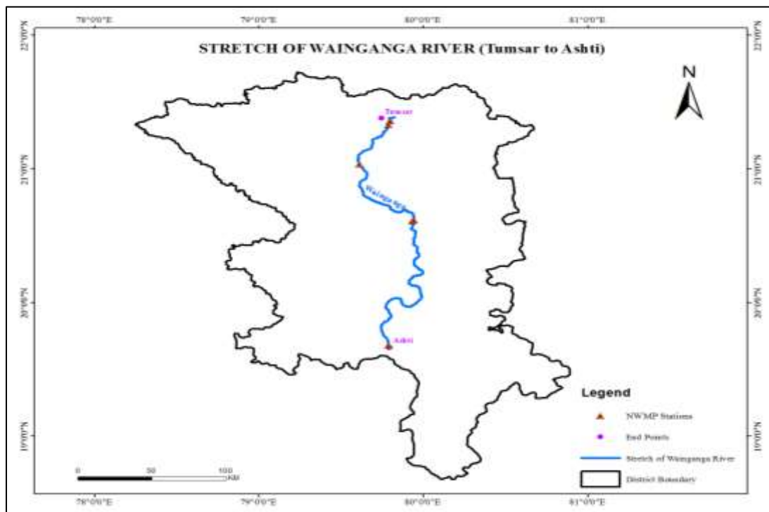
Figure 3 Map Showing NWMP Stations across Wainganga River Stretch