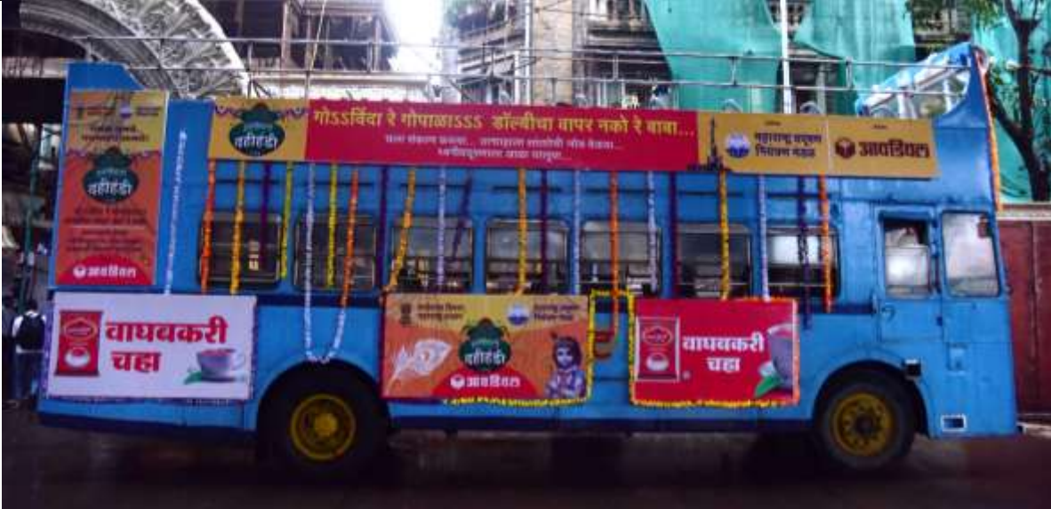
Anti-noise pollution awareness rally on the eve of Dahi-handi (Gopalkala) festival was organized with participation of famous Marathi film industry celebrities on the Open Deck Bus Service of Best Transport Service in the month of August 2017.

famous Marathi film industry celebrities on the Open Deck Bus Service of Best Transport Service. Notable film and TV celebrities were present at this rally. On the eve of Dahi Handi, this rally was organized in the presence of street-play celebrities in Dadar, Lalbagh area. Eco-friendly Dahi Handi was smashed in the presence of young celebrities from Zee TV and ETV. At the time, in front of Chhabildas High School in Dadar, the noise-free eco-friendly Dahi Handi was smashed along with celebrities from the film and theatre industry. Public Relations Officer, MPCB was present during this event.