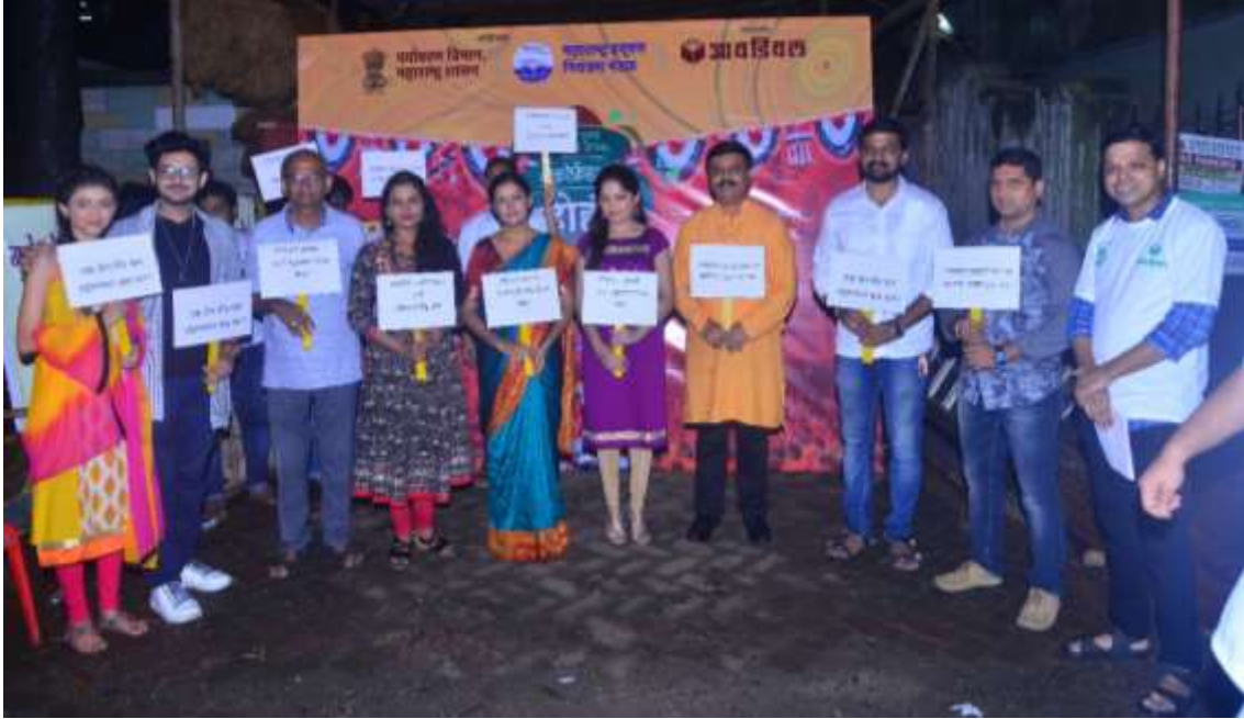
Anti-noise pollution awareness rally on the eve of Dahi-handi (Gopalkala) festival was organized with participation of famous Marathi film industry celebrities on the Open Deck Bus Service of Best Transport Service in the month of August 2017.