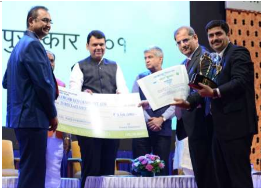
On the eve of World Environment Day on 5th June 2017, Hon'ble Shri Devendra Fadnavis, Chief Minister, GoM giving away Vasundhara Awards to the entrepreneurs who have introduced best environment-friendly practices in their industry, at Y. B. Chavan Auditorium, Mumbai.