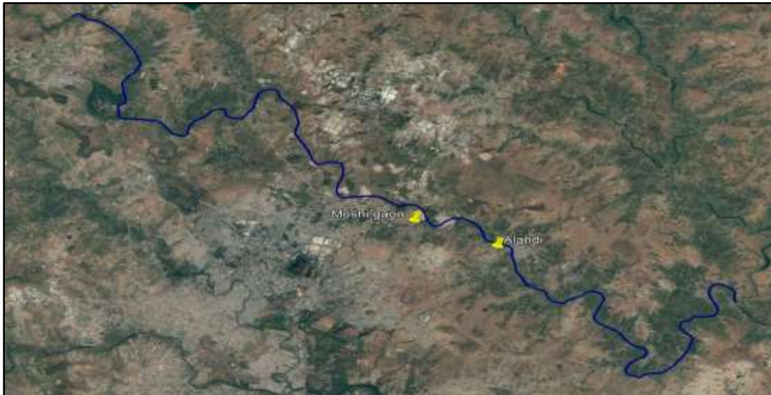
Figure 1 Polluted Stretch of Indrayani River

Indrayani river originates at Kurvande, near Lonavla in the Sahyadri ranges and meets Bhima river at Tulapur. It flows through Kamshet, Talegaon, Dehu, Pimpri-Chinchwad and Alandi while later meeting the Bhima river at Tulapur. It is one of the major tributaries of Bhima river which covers major area around Pune. There is a hydroelectric dam called Valvan Dam on the Indrayani at Kamshet.