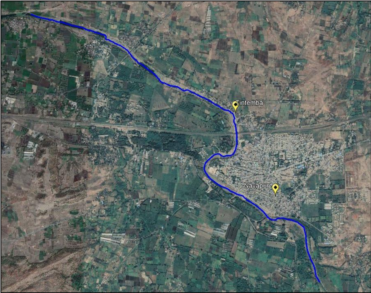
Figure 1 Stretch of Rangavali river

Rangavali River originates near Kadupada in Sakri taluka in Dhule District & meets Ukai Dam on Tapi River.