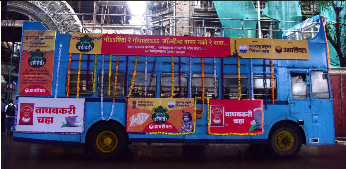
Anti-noise pollution awareness rally on the eve of Dahi-handi (Gopalkala) festival was organized with participation of famous Marathi film industry celebrities on the Open Deck Bus Service of Best Transport Service in the month of August 2017.

program, anti-noise pollution awareness rally was organized by famous Marathi film industry celebrities on the Open Deck Bus Service of Best Transport Service. Notable film and TV celebrities were present at this rally. On the eve of Dahi Handi, this rally was organized in the presence of street-play celebrities in Dadar, Lalbagh area. Eco-friendly Dahi Handi was smashed in the presence of young celebrities from Zee TV and ETV. At the time, in front of Chhabildas High School in Dadar, the noise-free eco-friendly Dahi Handi was smashed along with celebrities from the film and theatre industry. Public Relations Officer, MPCB was present during this event.