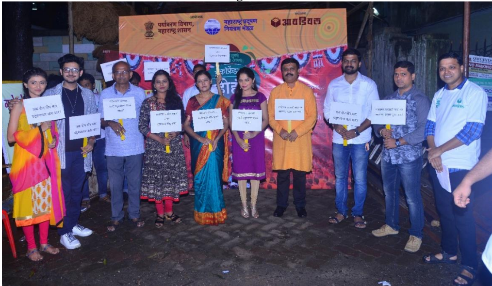
Anti-noise pollution awareness rally on the eve of Dahi-handi (Gopalkala) festival was organized with participation of famous Marathi film industry celebrities on the Open Deck Bus Service of Best Transport Service in the month