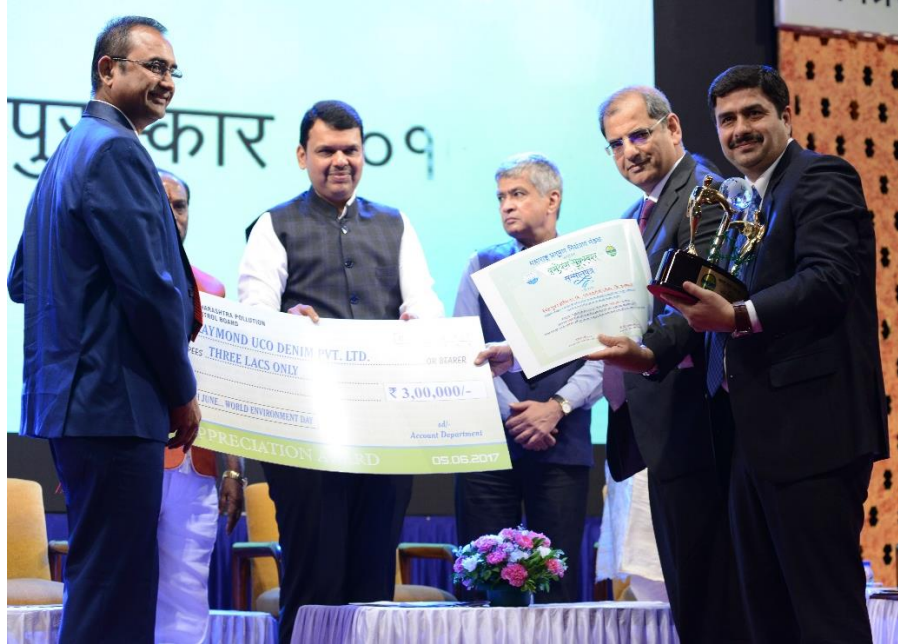
On the eve of World Environment Day on 5th June 2017, Hon'ble Shri Devendra Fadnavis, Chief Minister, GoM giving away Vasundhara Awards to the entrepreneurs who have introduced best environment-friendly practices in their industry, at Y. B. Chavan Auditorium, Mumbai.