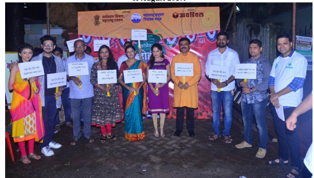
Anti-noise pollution awareness rally on the eve of Dahi-handi (Gopalkala) festival was organized with participation of famous Marathi film industry celebrities on the Open Deck Bus Service of Best Transport Service in the month of August 2017.