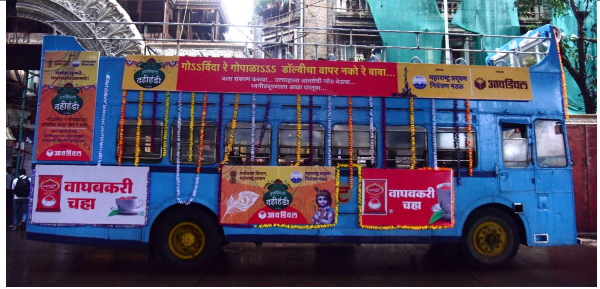
Anti-noise pollution awareness rally on the eve of Dahi-handi (Gopalkala) festival was organized with participation of famous Marathi film industry celebrities on the Open Deck Bus Service of Best Transport Service in the month of August 2017.