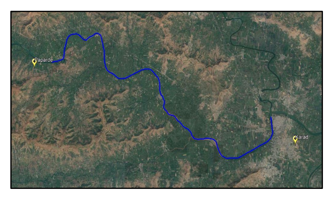
Figure 1 Stretch of Koyna River

The Koyna River is a tributary of the Krishna River which originates in Mahabaleshwar, Satara district, Western Maharashtra, India. It rises near Mahabaleshwar, a famous hill station in the Western Ghats. The Koyna River Basin generally trends, north – south and covers an area of 2,036 km² in the Deccan terrain of the district of Satara in the state of Maharashtra. It is dammed by the Koyna Dam at Koynanagar forming the Shivsagar reservoir. Koyna River is supported by four tributaries. They are namely Kera, Wang, Morna and Mahind and all of them originate in the Western Ghats. Among these rivers Kera, Wang and Morna are dammed.