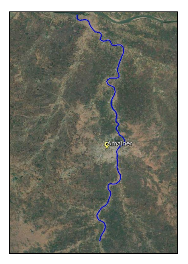
Figure 1 Stretch of Bori River