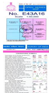
FIGURE-1 STUDY AREA MAP OF THE PROJECT (10 KM RADIUS)