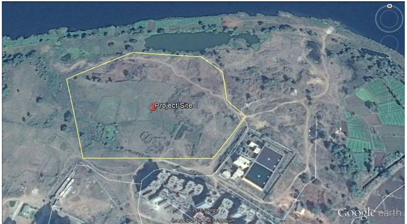
Figure 2: Satellite Image of the Project site