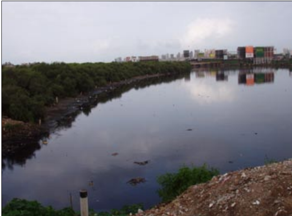
03 Mahim Creek from Dharavi side