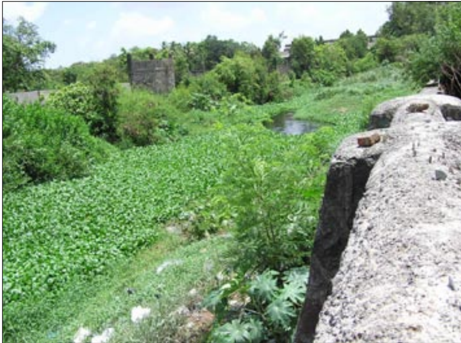
15 Samhita Complex, Andheri Kurla Road, Safed Pool - Note growth of Hyacinth and other vegetation.