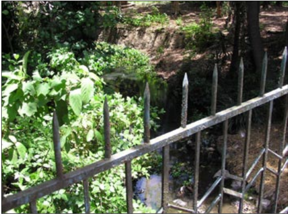
18 Powai Lake Overflow near Ambedkar Garden.