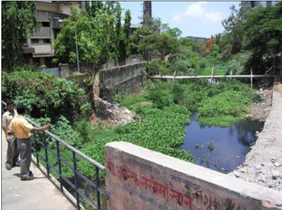
17 Saki-Vihar Cross Road, Opp. Marve Industrial Estate - Indicating dumping of scrap materials and growth of vegetation.