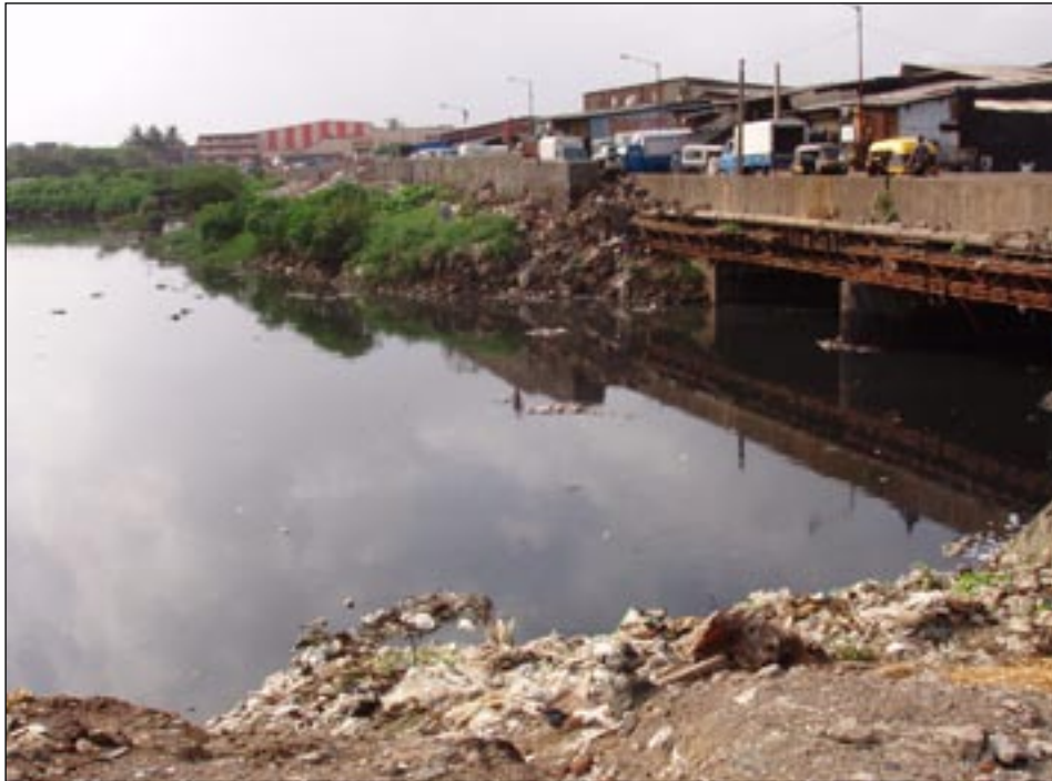
11 Mithi River near Airport - II