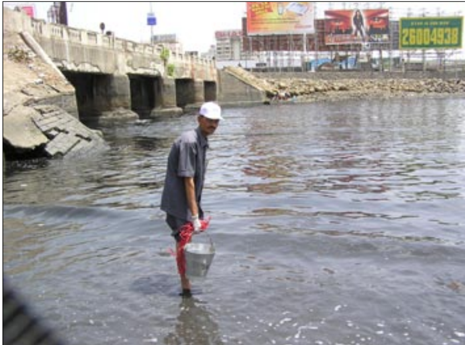
1. Mahim Bay, before Mithi river meets sea.