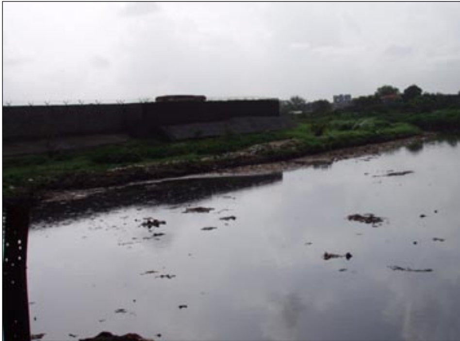
10 Mithi River near Airport - I