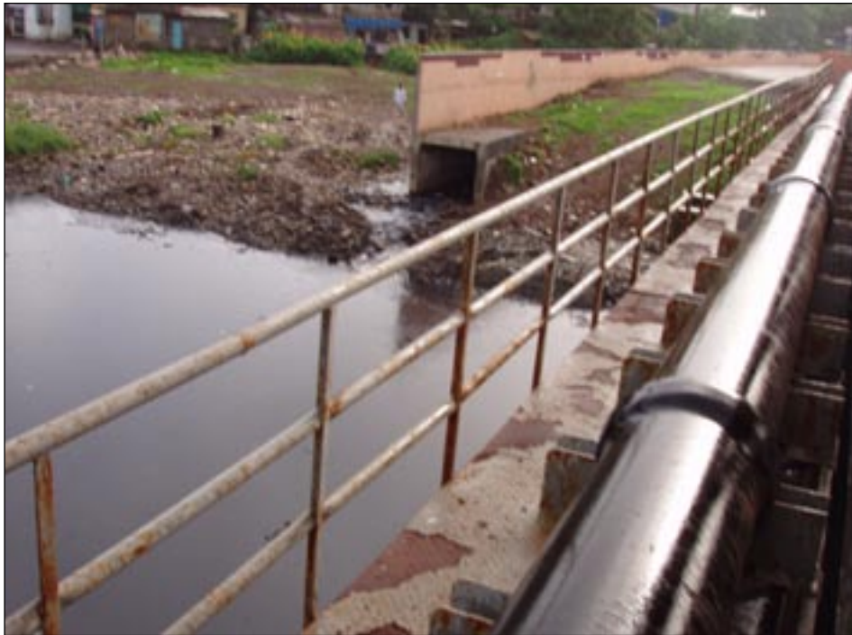
06 Sewer outlet near Wockhardt office