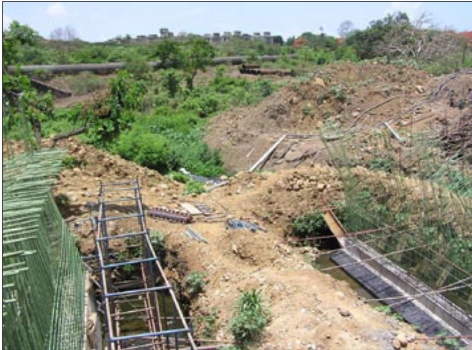
16 Vikhroli - Jogeshwari Link Road - River is reconstructed under new road.