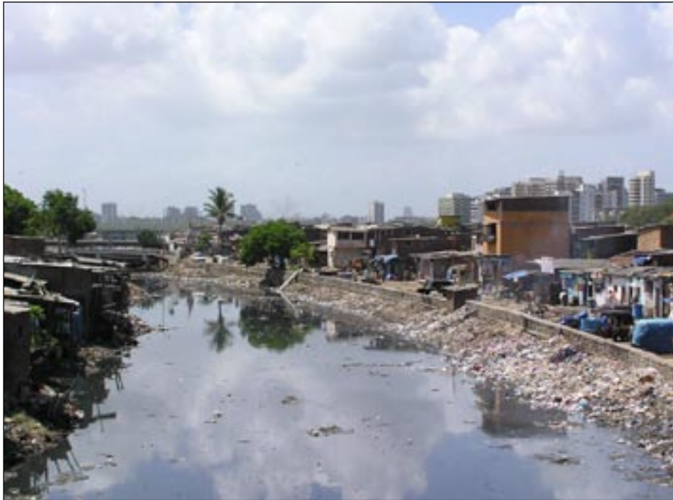
07 Bridge after taking left turn from HP Petrol Pump - Note the width of river.