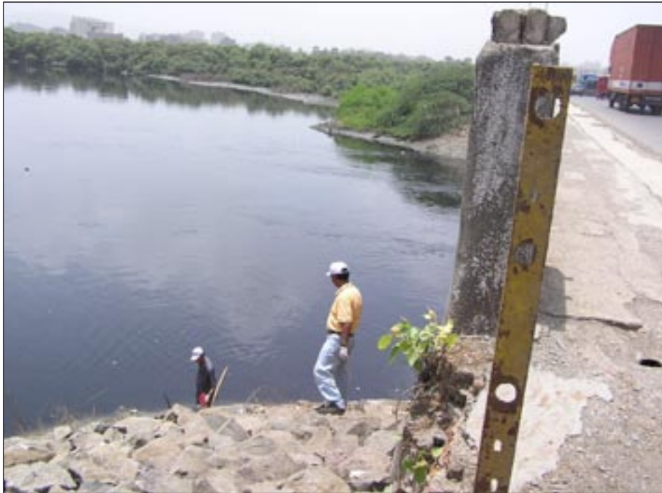
05 Kalanagar Junction showing mangroves of “Salim Ali Bird Sanctuary”