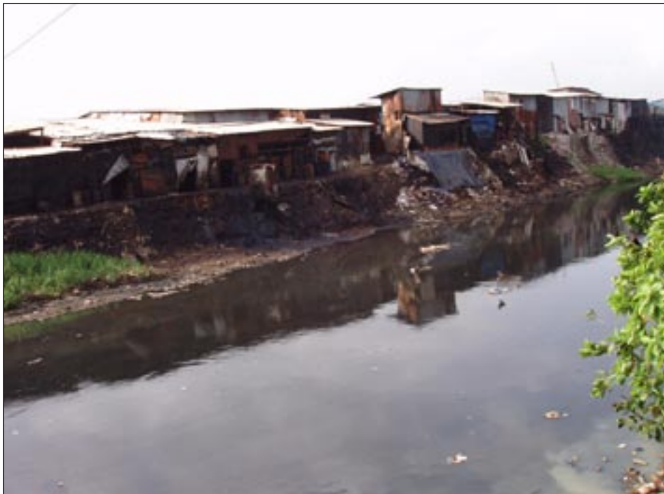
14 Unauthorized oil refineries at Old Airport Road