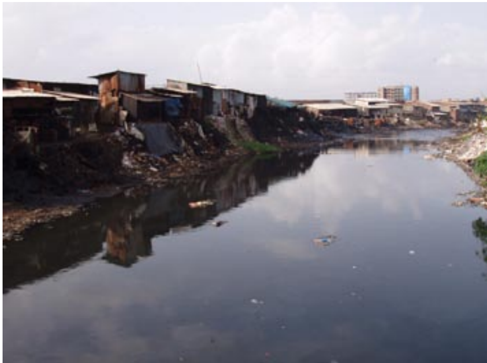
13 Oil Industry at Old Airport Road -1