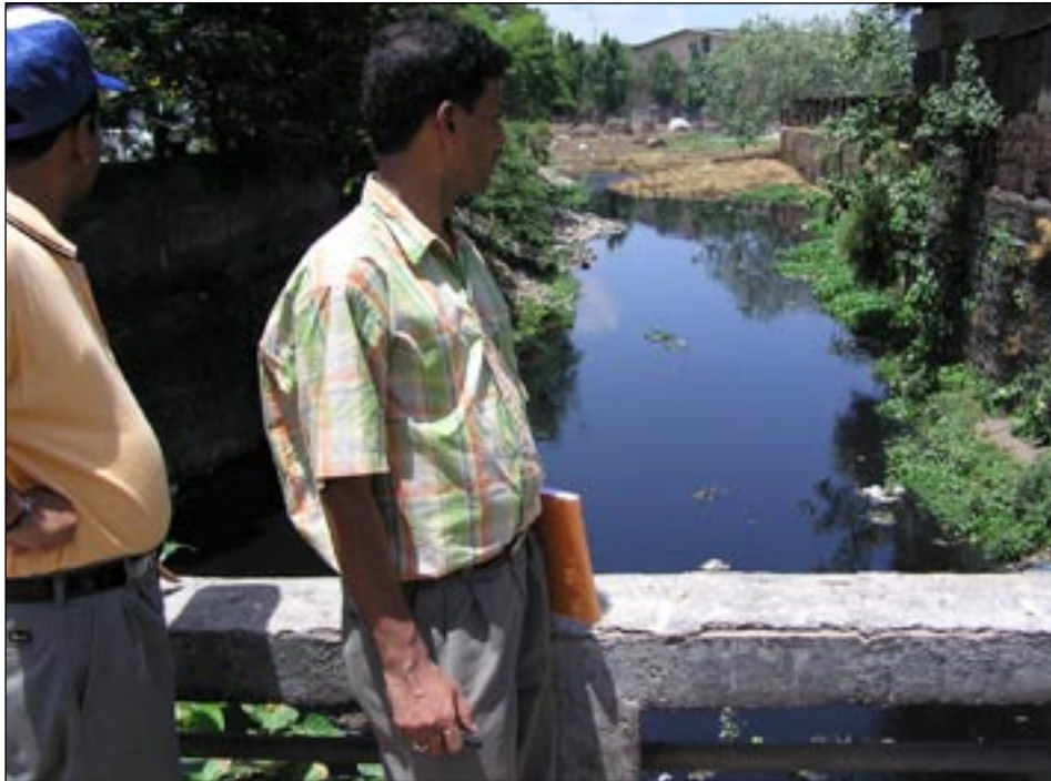
09 CST Road, Kalina - This is a highly polluted area and a heaven for recyclers.