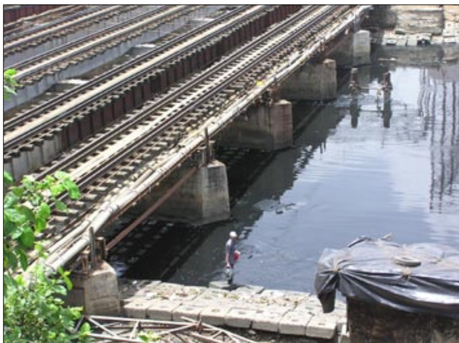
2. Under Western Express highway showing septic nature of Mithi River by it's black colour