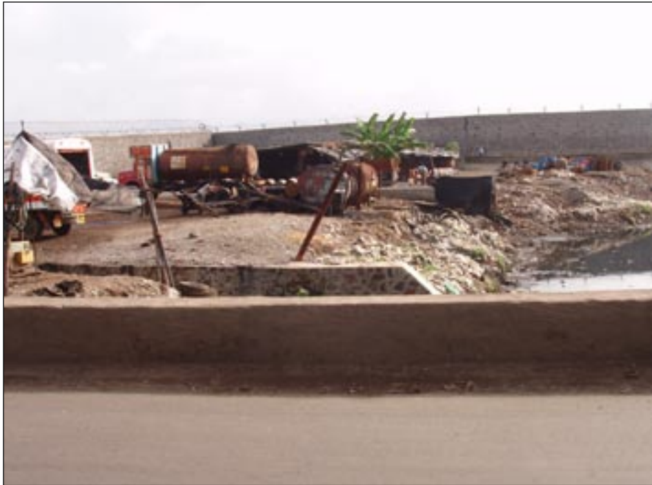
12 Oil Industry at Old Airport Road