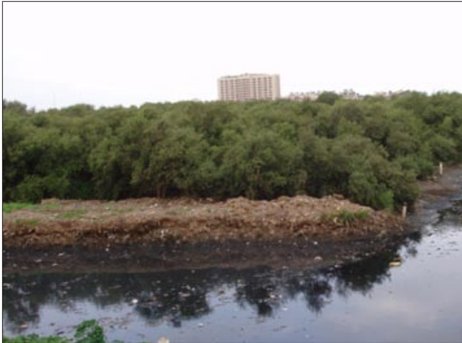
04 Mangrove at Mahim creek