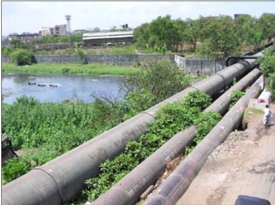
08 Vokala Pipeline near Hyatt Hotel - Buffaloes enjoying swim.