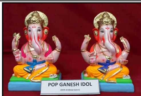
Ganesh idol made up of Plaster of Paris