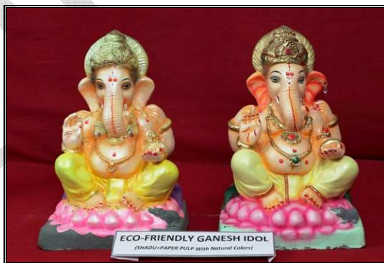
Eco-Ganesh / idol made up of Shadu and paper pulp