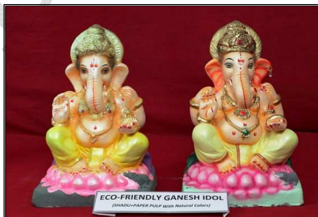
Fig.4 : Eco-Ganesh idol made up of Shadu and paper pulp.