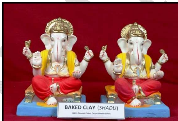
Fig.3: Ganesh idol made up of "Shadu"