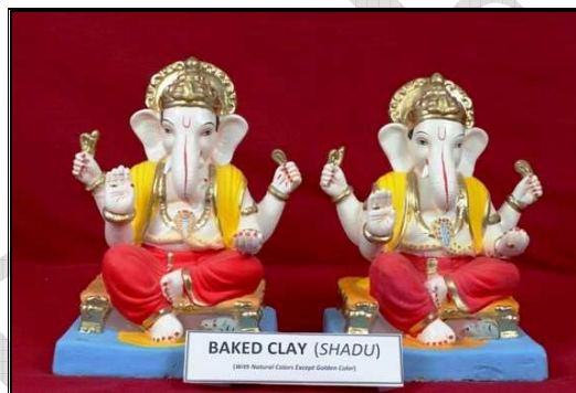
Ganesh idol made up of “Shadu”