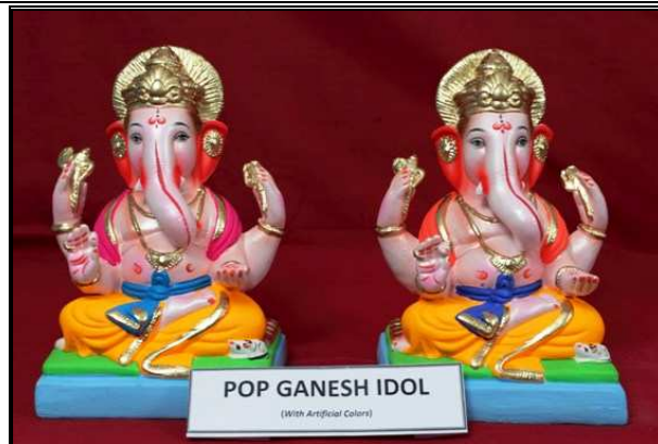
Fig.2 : Ganesh idol made up of Plaster of Paris

In all 7 Nos. of Containers are taken for study. One Plastic container filled with tap water is kept as a control. In other containers Lord Ganesh Idols (PoP, Shadu and Eco-friendly) are separately kept in duplicate. Fix volume of 65 liters tap water is added to each container to ensure complete immersion of idols. Water is collected at '0' hrs (Control), and after defined intervals from each container for water quality analysis. Also, physical observations are recorded for each container and are supported with Photographs and video till disintegration of "Shadu" & "Eco" idols.