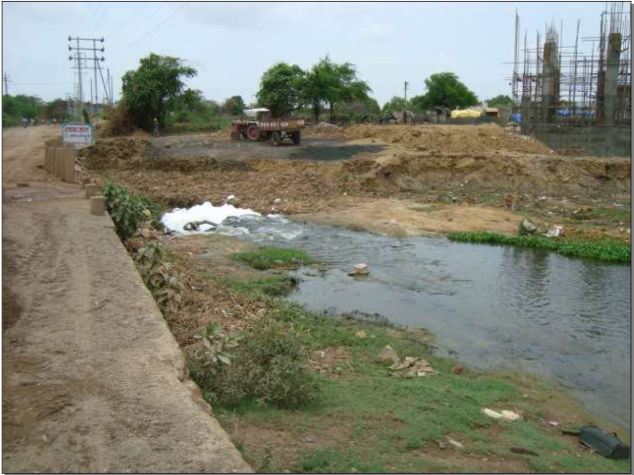
Figure 8: Zarpat River near Pathanpura Gate (downstream)