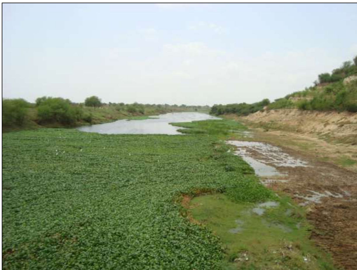
Figure 9: Confluence point of Zarpat & Erai River near village Mana (Zarpat River is suffocated by E-cornia vegetation)