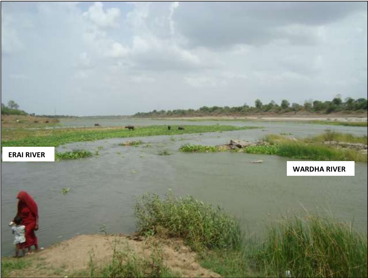
Figure 5: Confluence point of Erai & Wardha River at Village Hadasti