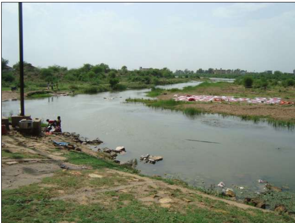
Figure 4: Erai River near Datala Road, Chandrapur (30 % water source of Chandrapur City)