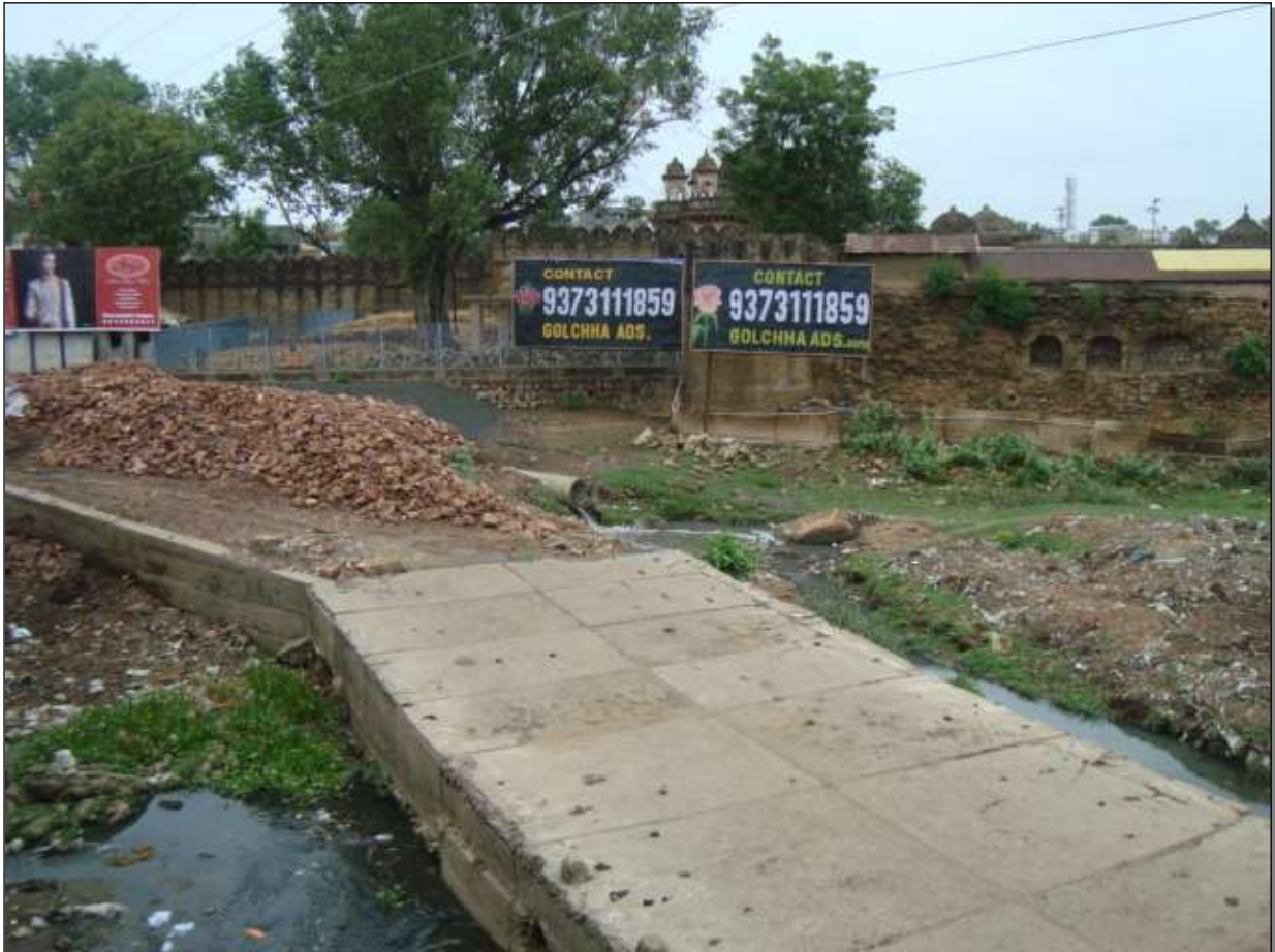
Figure 7: Zarpat River near Anchaleshwar Gate, Chandrapur

Domestic pollution – There are human settlement/local bodies/municipal council located in the vicinity of Zarpat River and the domestic effluent discharged by these settlements is directly meeting into Zarpat River at various location without treatment that includes partly sewage of Chandrapur City including seepages from soak pit of M/s MEL (Maharashtra Elektros melt Ltd.). Zarpat River flows diagonally from Chandrapur city and 60 to 70 % of Chandrapur untreated sewer is discharging into the Zarpat River at various location.