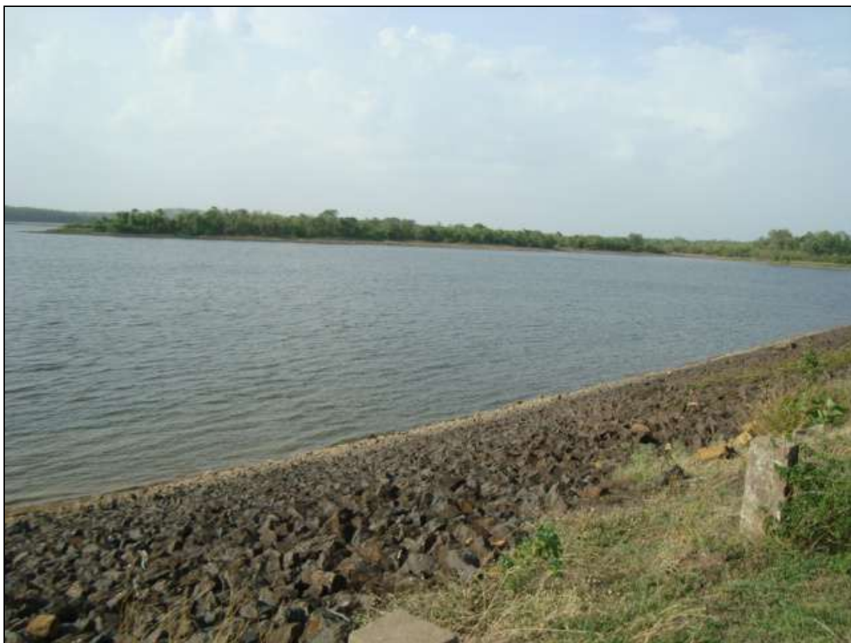
Figure 3: Erai River Dam (Water source of Chandrapur city and M/s CSTPS)

The Erai River is having self-origination nearby Chimur and meets to Wardha River near Ballarpur. The MSEB has constructed Dam on this river for their own water supply for thermal power station and their colony and the Chandrapur Municipal council pumps the water for Chandrapur Town and lifts about 54,0,30 CMD of water and generated 37,800 CMD of sewage. The Chandrapur town does not have sewage treatment plant and also there is no underground sewerage system and part of sewage is treated in septic tanks and all the sewage through various nallas discharges into Era River. The treated effluent of CSTPS is partly discharged into the Erai River and part of it consumed by the power station for different purposes within their premises. The total length of Erai River is 25 km from origin to confluence into Wardha River near Hadasti Village.