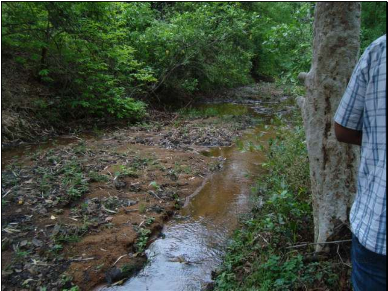
Figure 6: Zarpat River origin from natural spring near Lohara Village

Zarpat River originated from natural spring near Lohara village towards eastside of Chandrapur city approx. 10 km from Chandrapur city. It further flow through slum area near M/s Maharashtra Elektros melt Ltd., Mul Road, Chandrapur i.e. Sanjay Nagar, Krishna Nagar, Indira Nagar afterwards enter into the city, Anchleswar Ward, Pathanpura and meets into Erai River near Mana village. The stretch from M/s Maharashtra Elektros melt Ltd. and up to Pathanpura Gate is deteriorated due to discharging of untreated domestic effluent from slum area and urban areas of Chandrapur old city. The entire Zarpat River near Anchleswar Temple and up to confluence with Erai River is suffocated due to growth of Ecornia plants.