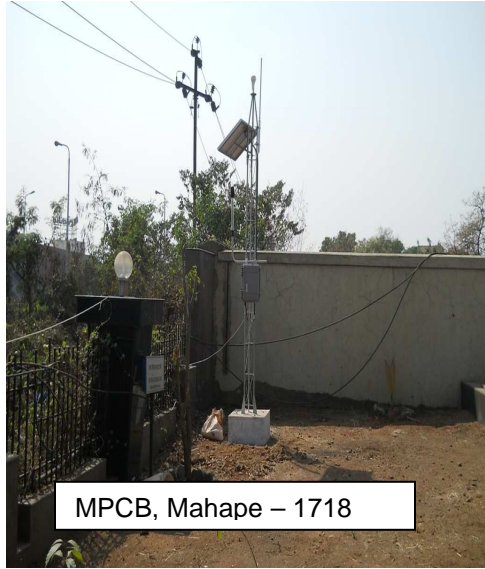
MPCB, Mahape – 1718